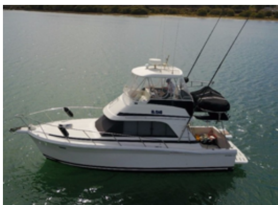
RIVIERA 33 FLYBRIDGE