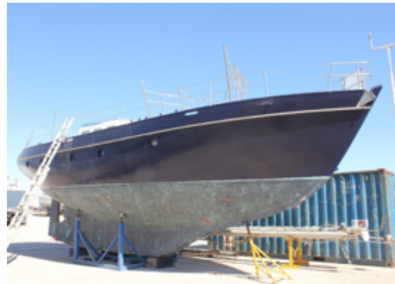
PIETER BEELDSNIJDER 39