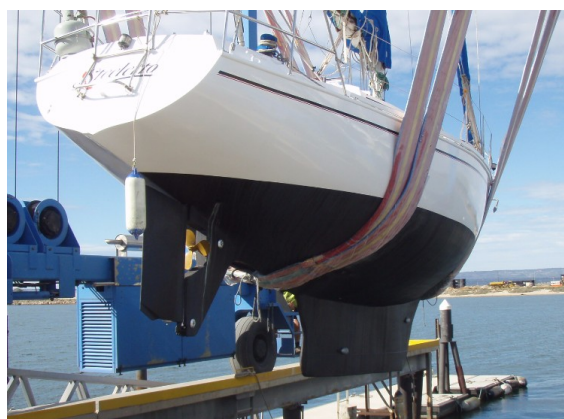
1993 ROBERTS 35