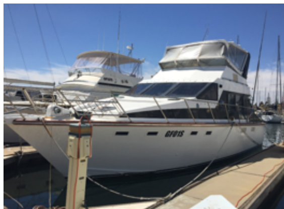
42 CUSTOM OFFSHORE CRUISER