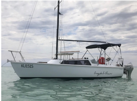
CATALINA 22/ BOOMAROO 22