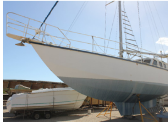
ROBERTS MAURITIUS 45 SLOOP