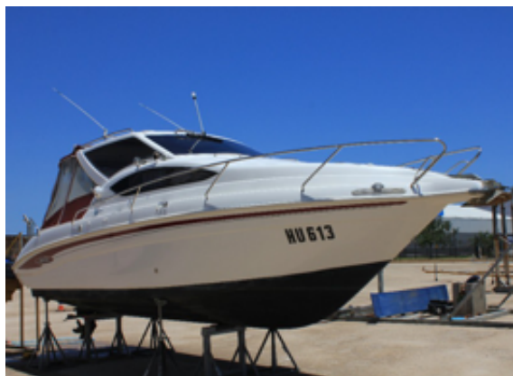
WHITTLEY CRUISER 660