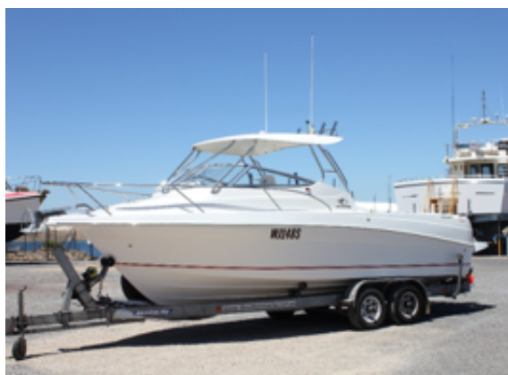
THEODORE 720 COASTAL