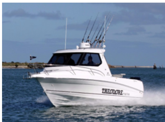
THEODORE 720 OFFSHORE