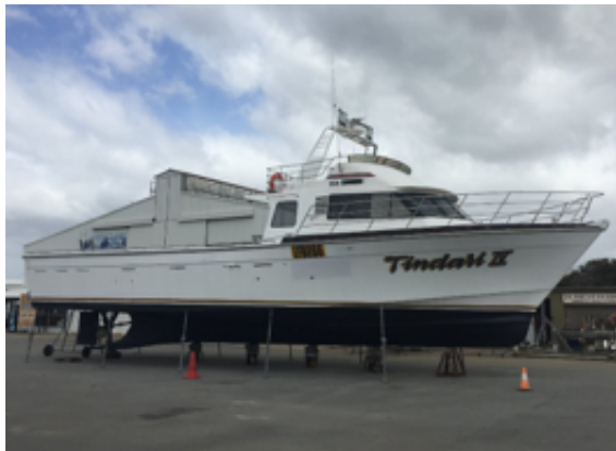
WESTCOASTER 60 COMMERCIAL